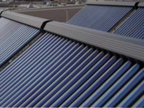
▲ Typical commercial hot water solar panels