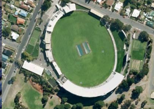
▲ Bellerive Oval, site stormwater design