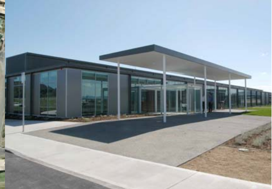
▲ Hydro Consulting Offices, 5 Green Star rated building, site stormwater design

JMG's Hydraulics Team provides design and advisory services to clients in commercial property, industry, municipal, institutional, recreational, healthcare and many other market sectors.