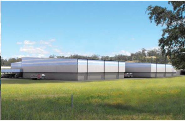
▲ Montage of Distribution Centre