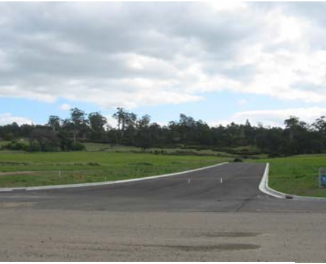
▲ Subject site